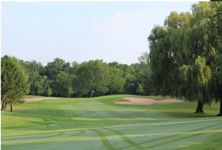
Above Left: The 372 Yard Par Four 7th Hole features a undulating green (above right) and is protected by a deep bunker on the front right (right).