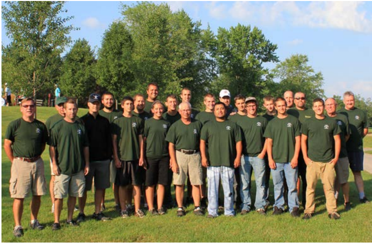
The grounds maintenance staff at Tuckaway Country Club