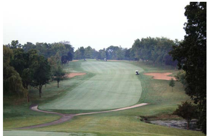
BELOW: Hole 1, the 392 Yard Par 4 in its current view