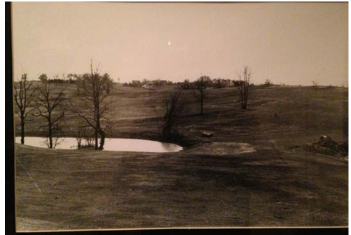
ABOVE: Holes 1 and 18 in 1967 during construction

In 1985 Jack Nicklaus competed in the GMO for the first time as a professional and finished second to Jim Thorpe. It was one of Jack's 58 second place finishes.