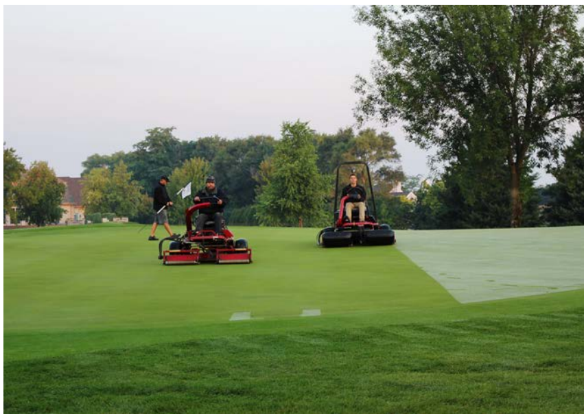
Mowing and rolling the 366 yard par four 4th hole.