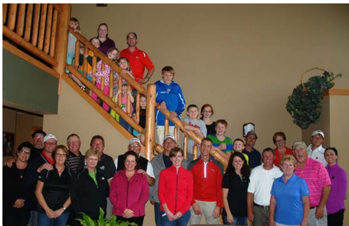
Many of the couples and families that were at the hospitality reception after golf joined for a picture.