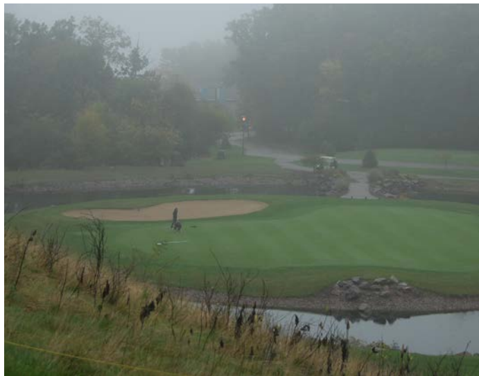
View from the tee of the island green hole, Lake Delton is in the background hidden in the fog and mist

I am happy to report that we had some new couples join us for the first time this year. Some of them made it a family weekend