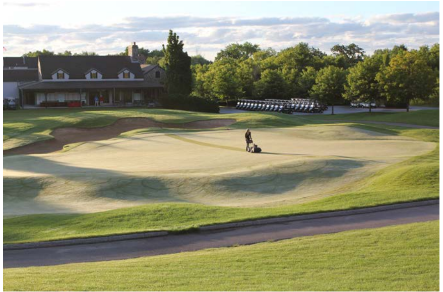
The 430 yard Par 4 18th hole with the clubhouse in the background makes for a perfect morning picture.

In the Yule Cup team competition the Bull at Pinhurst Farms won for the first time in part