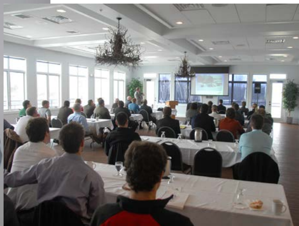
A eager crowd at the 5th Annual Assistants Seminar at Whispering Springs Golf Club in Fond du Lac.