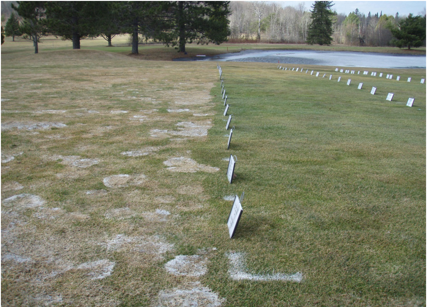
Figure 1. Heavy snow mold pressure at Wawonowin CC in Champion, MI showed the benefits of a strong fungicide program to manage snow molds.