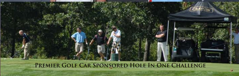
PREMIER GOLF CAR SPONSORED HOLE IN ONE CHALLENGE