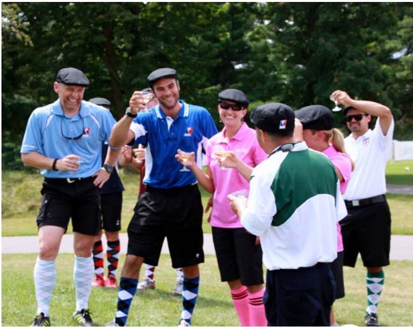
Footgolf players in official dress.