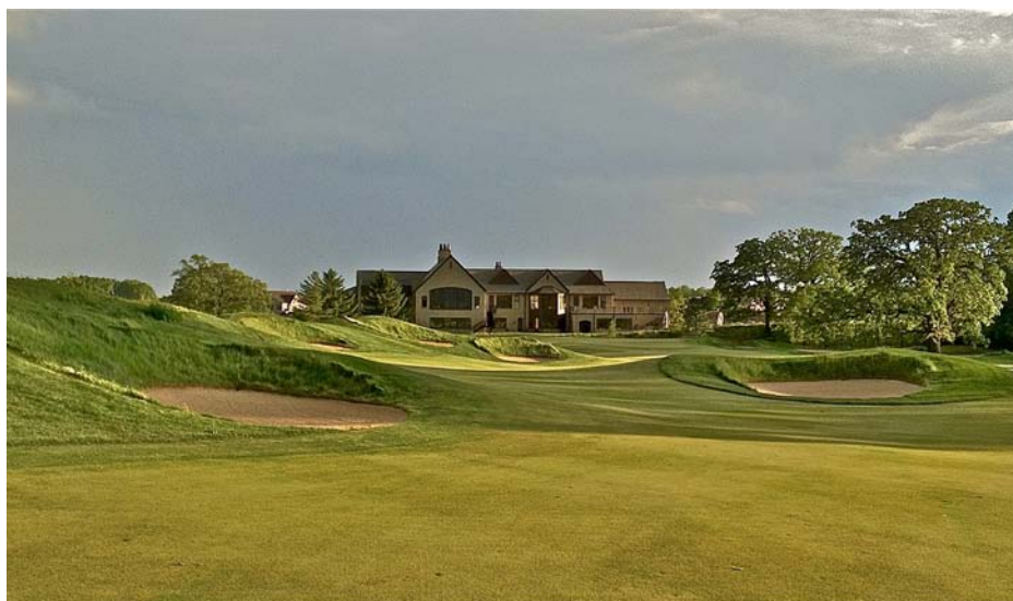
The 460 yard par 4 18th hole with the clubhouse in the background.

To enter the 72 hole stroke play event players need have a index of 9.4 or less, be one of the approximately 41 exempt players or qualify at one of the 9 qualifying tournaments. Players must qualify in the district of their home course unless pro-