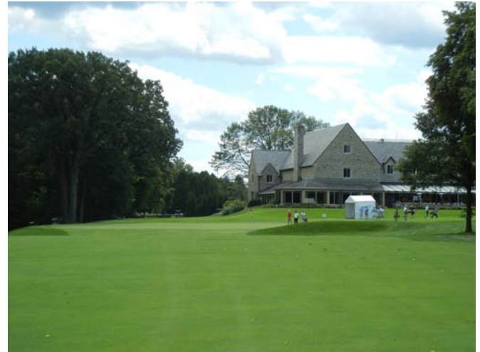
Erin Hills (Left) new clubhouses, cottages and caddieshack from the first hole. Blue Mounds (Right) 9th hole leads to the Lannon Stone Clubhouse built in 1926.