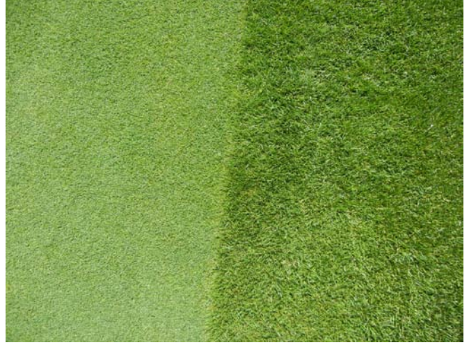
Erin Hills (Left) 1st hole shows the transition from fescue fairway, fescue first cut and fescue primary rough while on the Right Blue Mound offers bentgrass fairways and Bluegrass Rough.