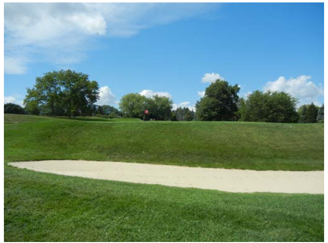
Erin Hills (Left) Hole 2 offers sloped natural looking bunkers while Blue Mound (Right) offers flat groomed bunkers with grass faces.