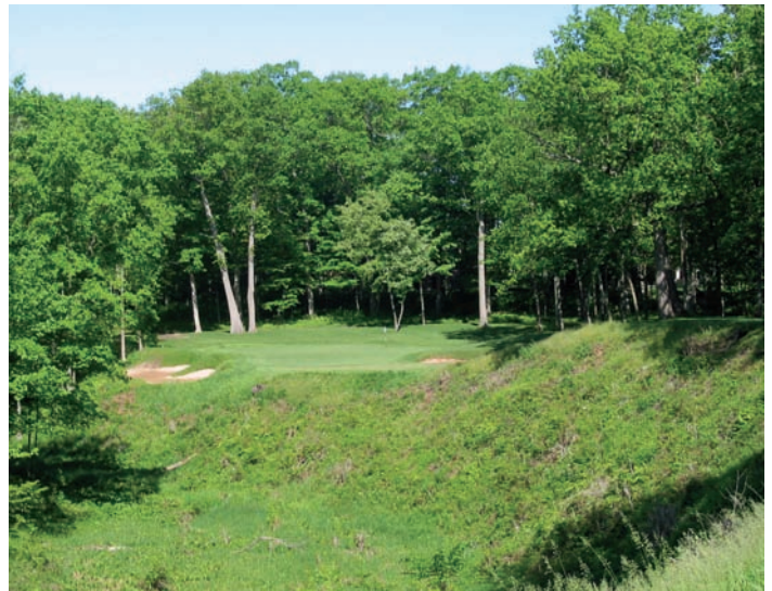
Hole 6, 193 yard par 3