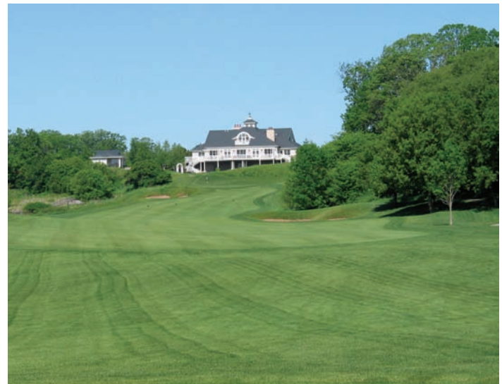
Hole 9, 453 yard par 4