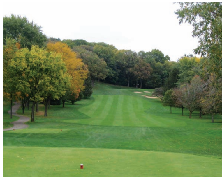
Hole 9 at Blackhawk, 347 yard Par 4.