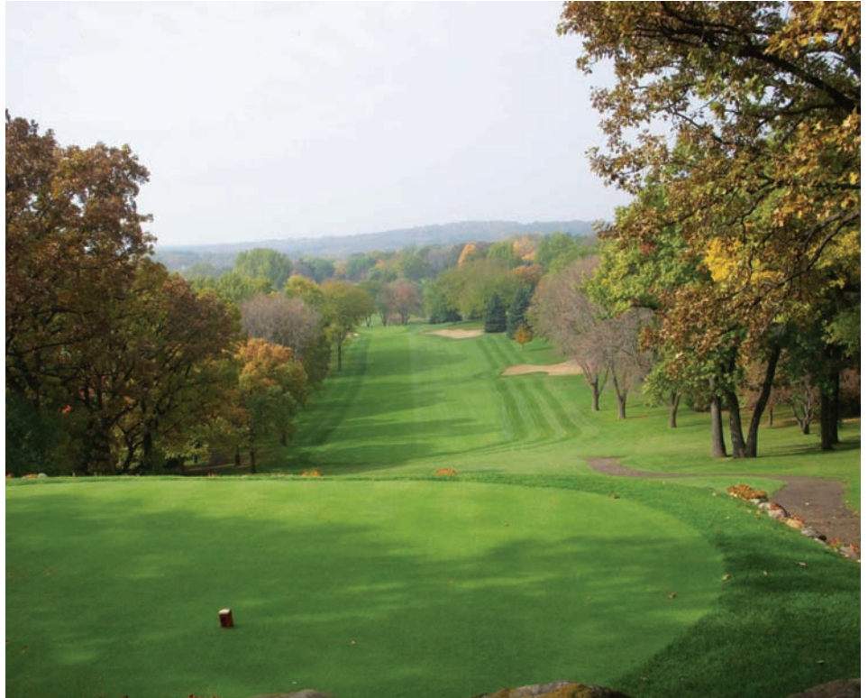
Blackhawk's 375 yard par 4 first hole is not as easy as it looks.

The course was opened in 1921 and designed by Charles H. Mayo, an English architect whose courses can still be played in England. His Chicago designs gave way to city growth many decades ago. The Club, over its history, hosted all of the WSGA, WWGA and PGA events, including the State Open. Twice in