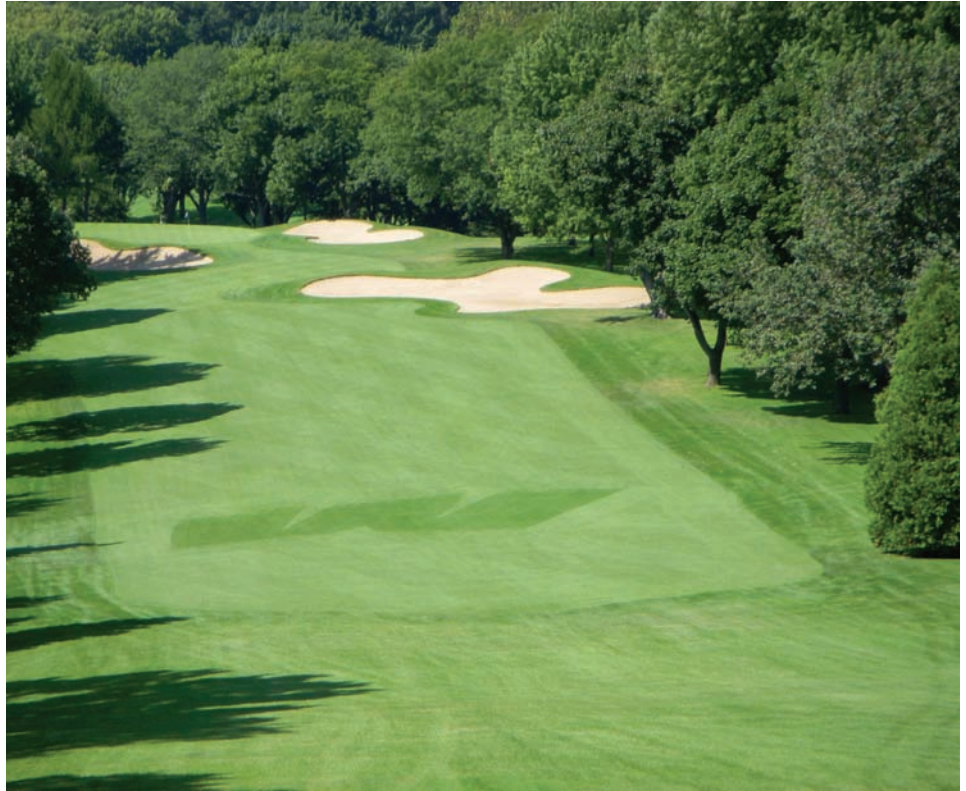
Blackhawks 310 yard 10th hole shows Badger Pride with a W striped in the fairway.

Your registration fee not only provides you the above benefits, but also supports the Wisconsin Turfgrass Research Sustainability Fund at the University of Wisconsin - Madison. Over the WTA Golf Fundraiser's long history, proceeds have gone directly to research projects and more recently have helped fund the Wisconsin Distinguished Graduate Fellowships in Turfgrass Research. Beginning this year, your participation will allow the WTA to add to the new Research Sustainability Fund at the UW Foundation. The difficult fiscal times have only amplified the need for quality research, and your presence at Blackhawk CC will help meet that need.