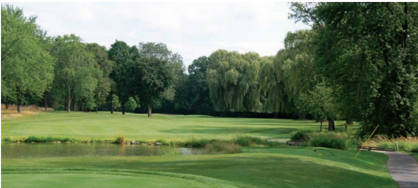
Ozaukee Country Club offers many great golf holes.