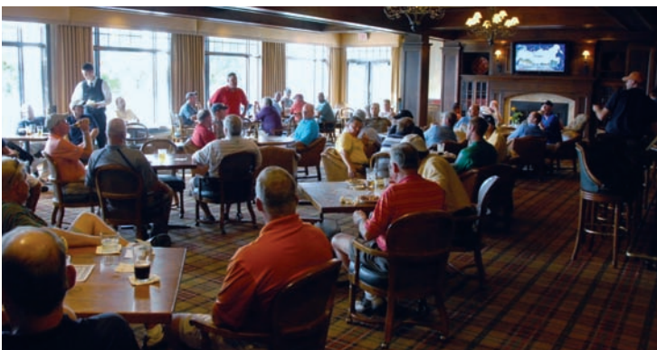
Post round socializing.