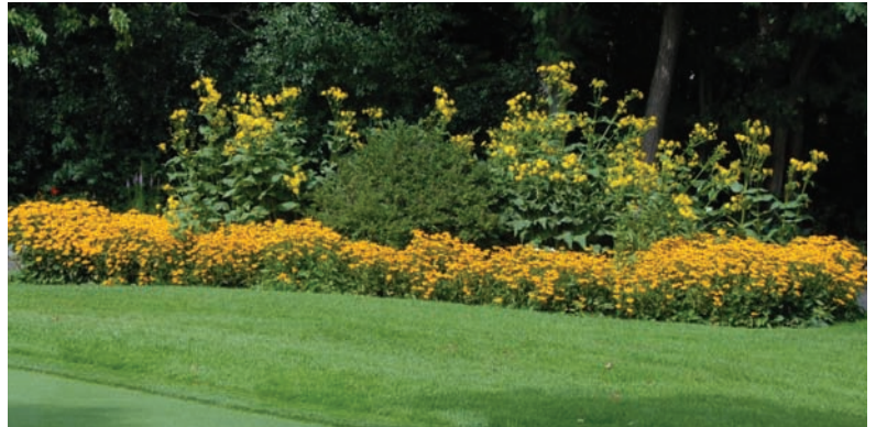
Just one example of the numerous beautiful ornamental plantings at Ozaukee CC.