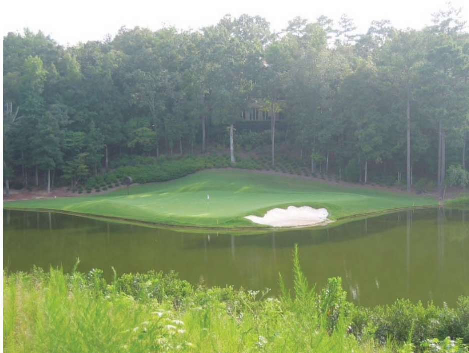
The haze and humidity is apparent at the 196 yard 17th hole with Parker Lodge in the background.

small wireless monitors are installed wirelessly in greens, tees and fairways to provide instant feedback to turf managers as they decide on irrigation practices. Although salinity is not usually a problem in Wisconsin, as more courses turn to effluent water sources measuring the level of soil salts will be imperative to soil health and water requirements.