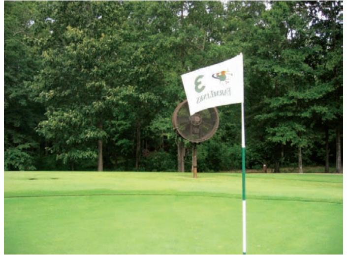
According to Mark Langner, Farmlinks' Director of Agronomy and Applied Research, fans are a priority to grow Bentgrass in Alabama due to the humidity and stagnant air.

details for each hole. Included with the hole layouts were the grass types and species, fertilizer type and rate, mowers used and cutting height, product studies and aerification practices.