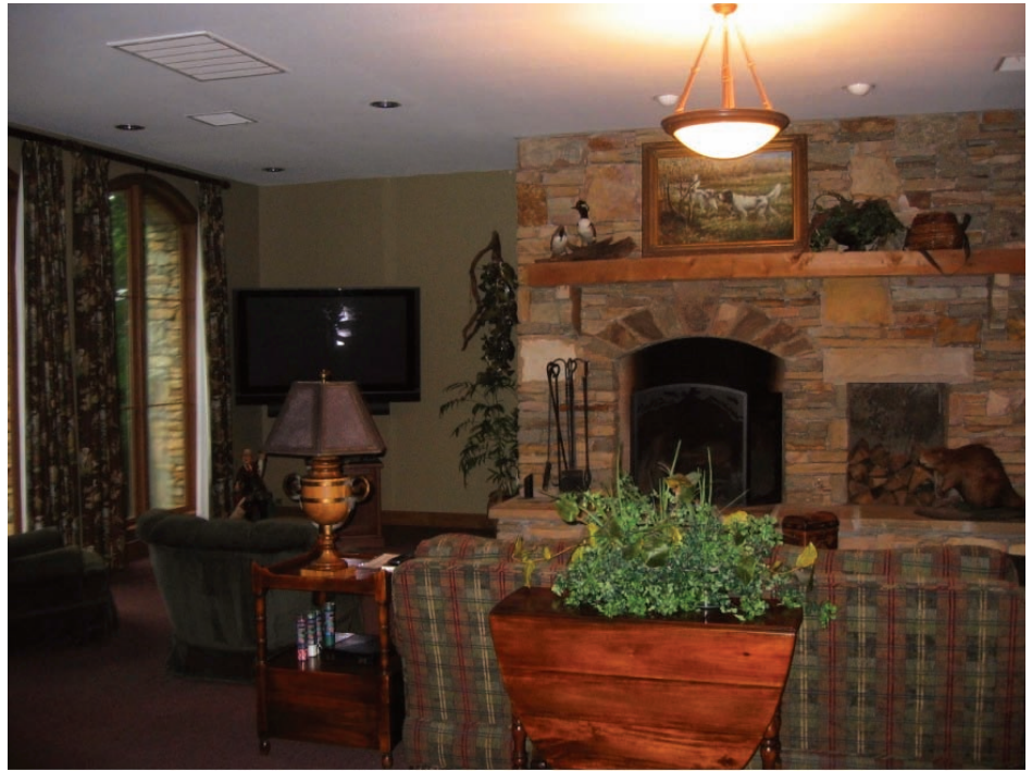
Parker Lodge offered great accommodations with a mix of hunting and golf related themes.