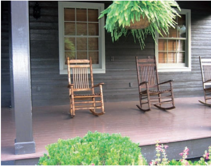
Even the clubhouse features a porch and rocking chairs to enhance the southern experience.