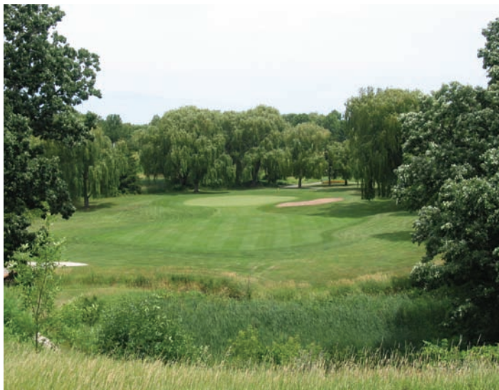
The par 3 Tenth hole at South Hills plays 205 from the elevated white tees.