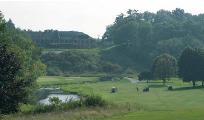
Pine Hills Country Club's 8th Hole with the clubhouse above.