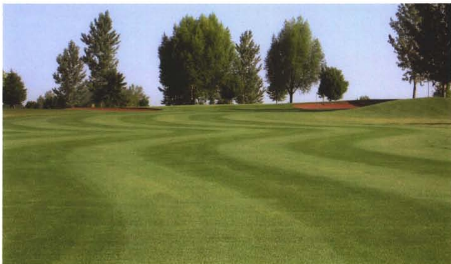
433 yard par 4, 17th hole at Lake Breeze