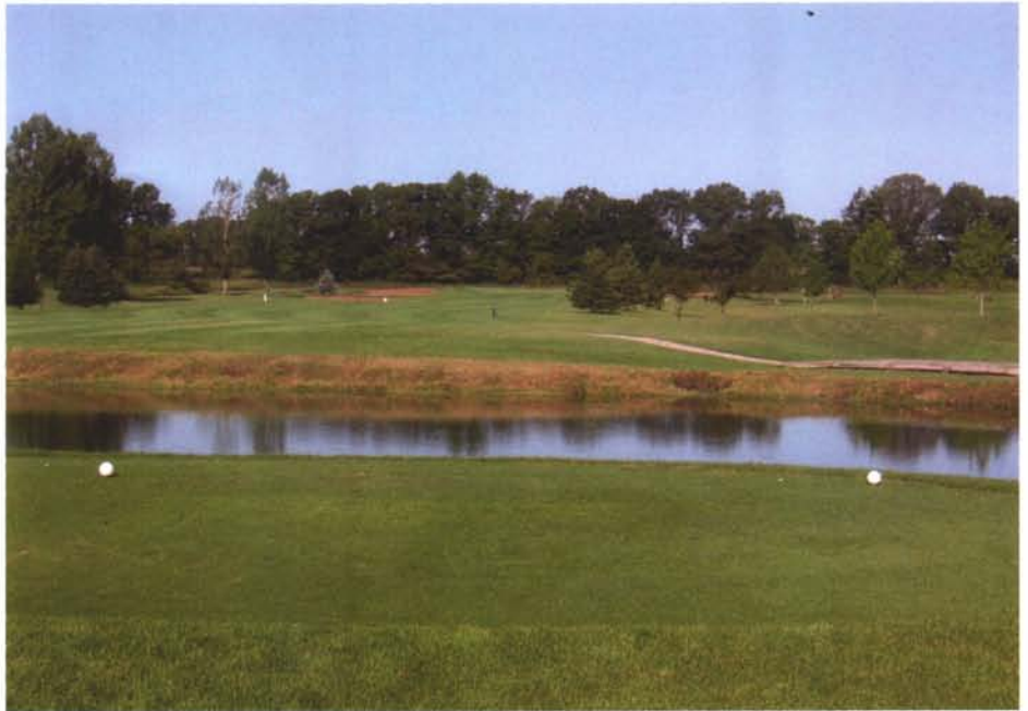
372 yard par 4, 11th hole at Lake Breeze

The course prep for both events was accomplished with the crew of