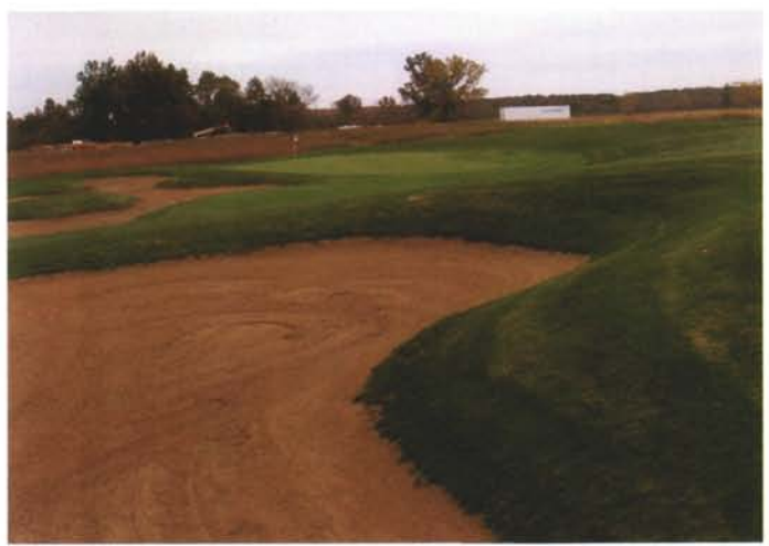
Hole 10 fairway and greenside bunkers at The Preserve on Lake Rathbun, Moravia, Iowa.

How we finalize the grassing of the bunker complex to control erosion and to get the project back into play is again dependent on the budget and the overall character or style of the course. Generally, we would either try to sod the bunker surrounds or we would use seed and an