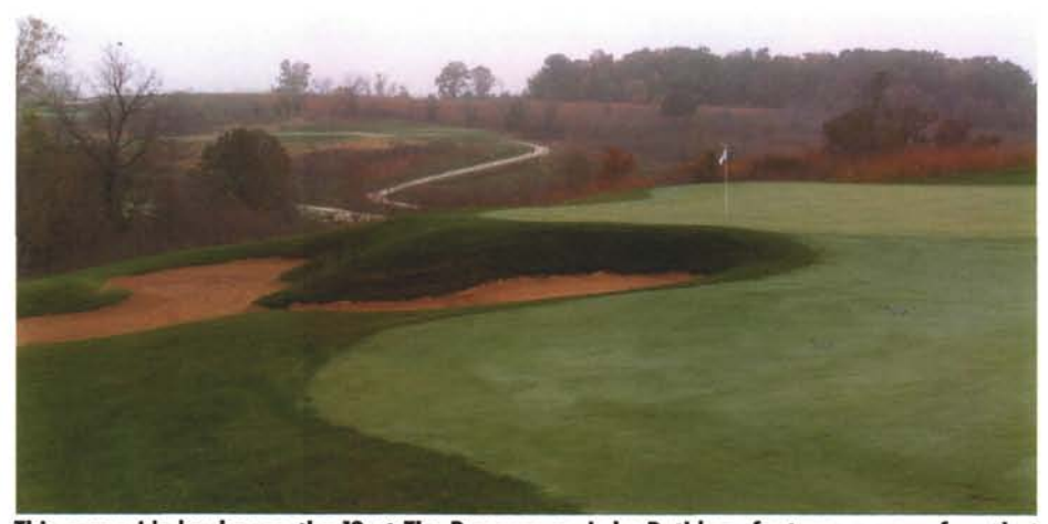
This greenside bunker on the 12 at The Preserve on Lake Rathbun, features a grass face that may require hand mowing and string trimming.