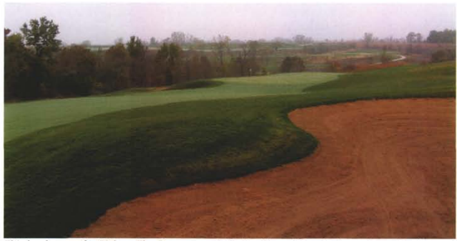
This bunker on the 12th at The Preserve on Lake Rathbun, Moravia, Iowa, has a flat bottom allowing maintenance with mechanical sand rakes.

If the course is going to be a public golf course with a somewhat more limited budget, we will create bunkers that are easier to maintain. We may still have elaborate capes and bays but the sand will probably be somewhat flatter in the bottom so that it can be maintained with a sand rake machine as opposed to requiring hand raking to pull the sand back up on the faces. Softer less rounded capes and grass faces can be maintained with more traditional rough mowers and sidewinder units. The more rounded capes and steeper grass faces may require mowing by hand or using string trimmers. If the course is private or a higherend destination course with a more substantial maintenance budget, we might not only create more bunkers but they will likely be somewhat larger and more dramatic. This might mean the capes get more rounded, the sand gets flashed up higher and we might use a more expensive white sand such as that which is available from Ohio or Arkansas.