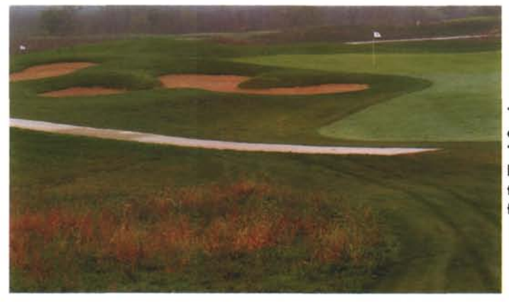
These greenside bunkers on the 6th hole at The Preserve on Lake Rathbun, are designed to allow for visibility from the hitting area.