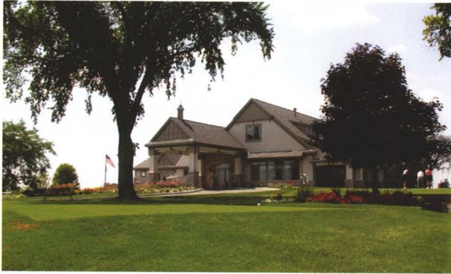
The Clubhouse at Oconomowoc Golf Club