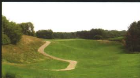
Grand Geneva Resort and Spa

In this game, it's all about perfect execution.