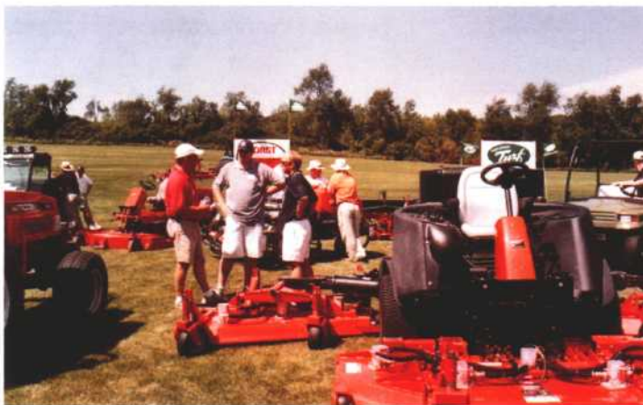
The relatively smaller golf course, sports, and landscaping equipment will also be displayed and available for demonstration.