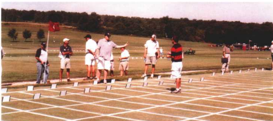
All the latest turf products and NTEPs will be exhibited to help you with your management decisions.