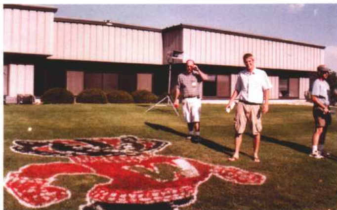
Athletic field demonstrations will also be included.