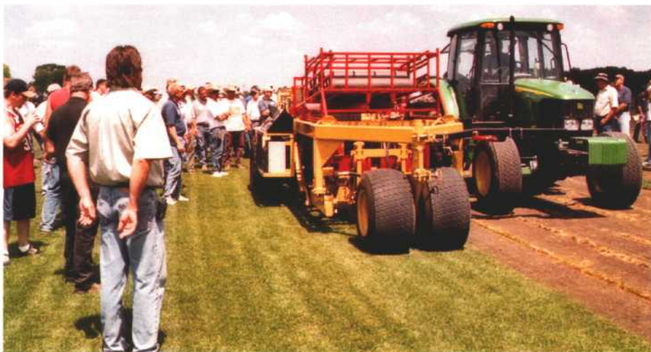
Equipment and crowds will be big at this year's Field Day.

The official TPI-WTA-MSC Field Day with trade show and turf research tours will take place on Thursday, July 26, and it starts off with a wonderful Wisconsin breakfast. On the previous evening, July 25, the sod producers will sponsor Family Night, which includes an extra trade show. It is oriented for families and includes games, fireworks, and other activities, and WTA members may attend for no additional fee. But just to clarify, the TPI-WTA-MSC Field Day is mainly on Thursday.