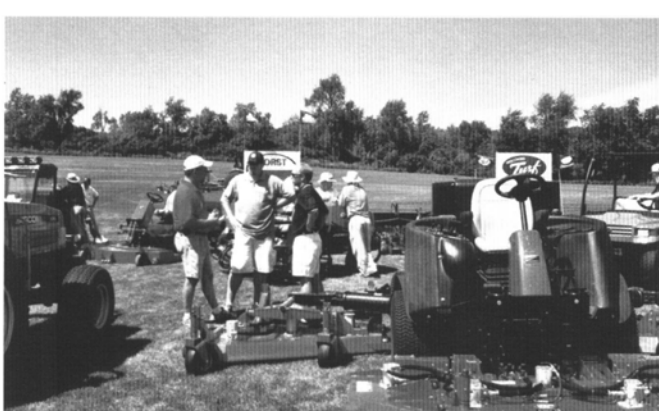
Lots of iron was checked over during the trade show.