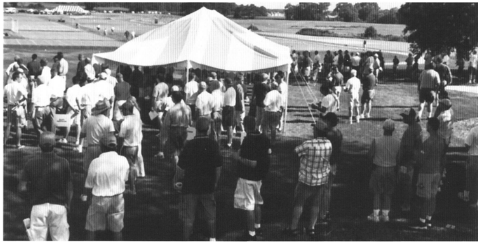
Large crowds gathering for the beginning of Summer Field Day 2006.