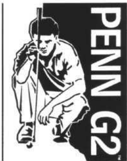
Putting Green Quality Creeping Bentgrass

The list of what makes PENN G-2 so different and so good goes on and on. Moderate fertility, heat tolerance, disease resistance and reduced Poa annua invasion are just a few of the highlights. What it all comes down to is simple. Whether you are building, renovating or interseeding, PENN G-2 is your grass. Why? Because it's as good as it is different.