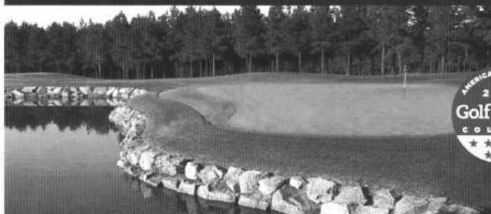
Best New Upscale Public Courses—Mattaponi Springs, Ruther Glen, Virginia