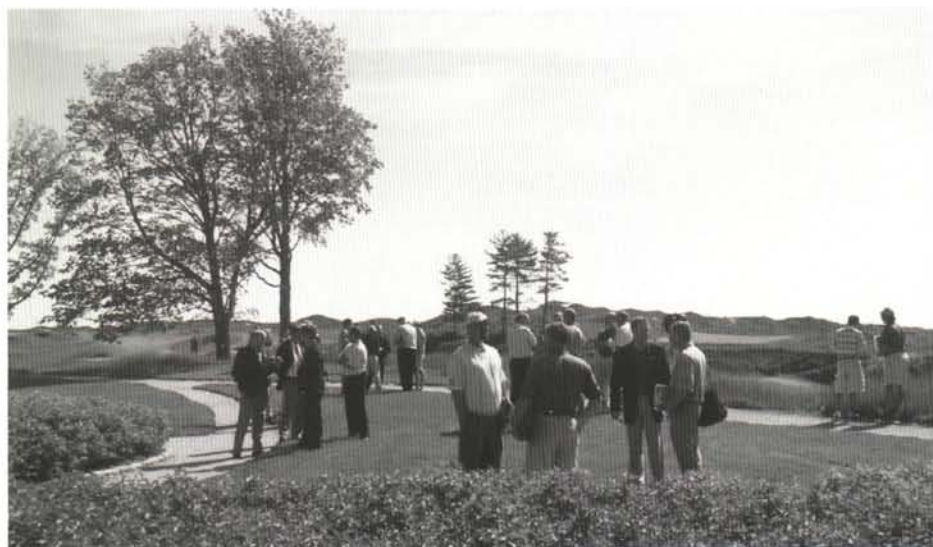
The golf course at Whistling Straits drew everyone out for a look at its beauty.