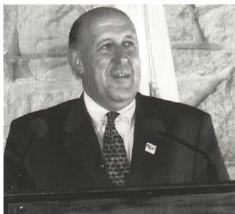
Gov. Doyle recognizes the huge roll golf plays in Wisconsin's economy.