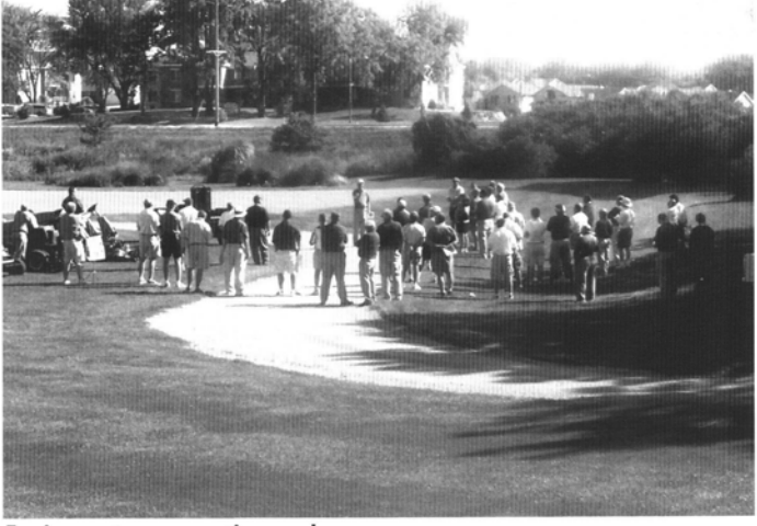
Equipment conversation and...

netic bedknife system triggered a lot of questions.