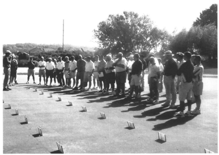
is a great day for golf turf research too!