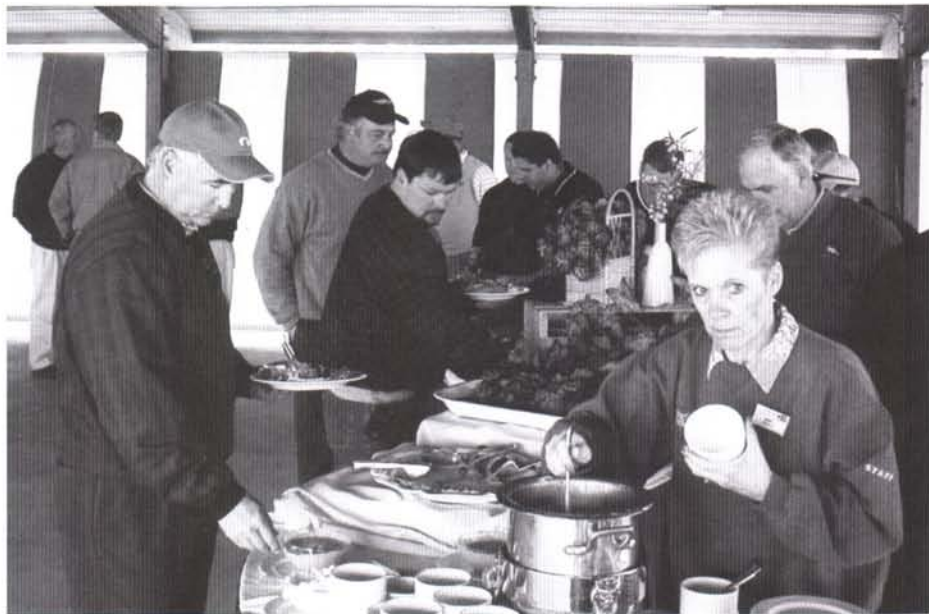
Lunch time at Grand Geneva.