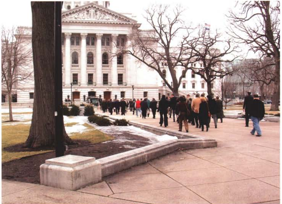
The Green Industry heads for the State Capitol for the first ever Green Industry Day on the Hill.

Issues discussed with the legislators and presented in the file included statements about pesticide and fertilizer products, land and water use, invasive species, health care, immigration and labor, environmental protection, and more. The main message, though,