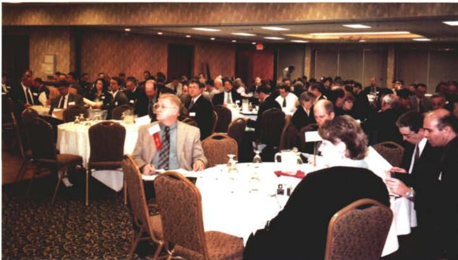
Over 200 participants gathered for the first ever Wisconsin Green Industry Day on the Hill.

agriculture representatives, and educators who spoke about issues important to agriculture and the green industry.