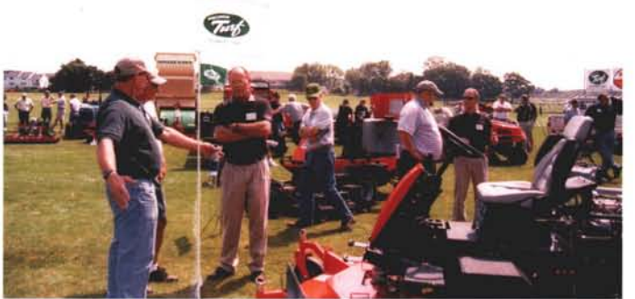
All your commercial questions get answered during the trade show segment.