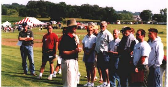
Attendees appreciate the personal attention they receive in getting questions answered during the research tour.