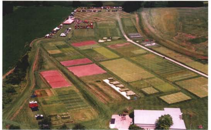
The place you want to be on July 26th is the WTA Summer Field Day.