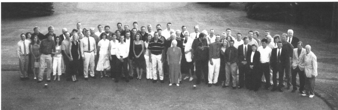
The evening concluded with a class picture!