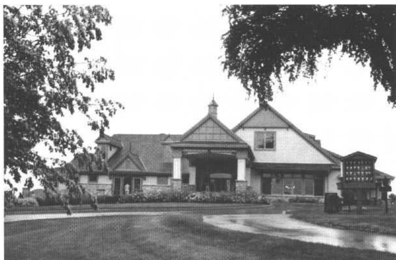
A new clubhouse welcomed WGCSA members at OCC.