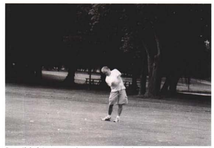
Beautiful fairways and mature woods brought the best out of everyone's game.