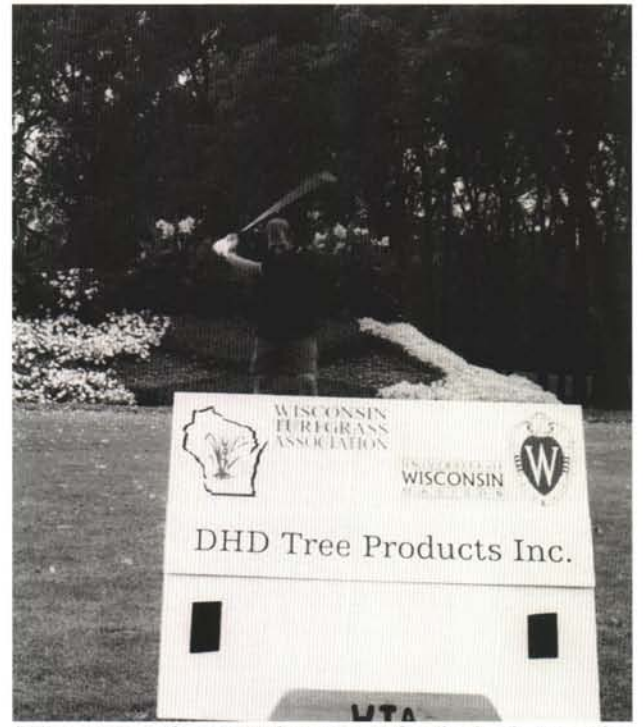
DHD was one of many Hole Sponsors for the fundraiser. The list of other Hole Sponsors is listed in the article.