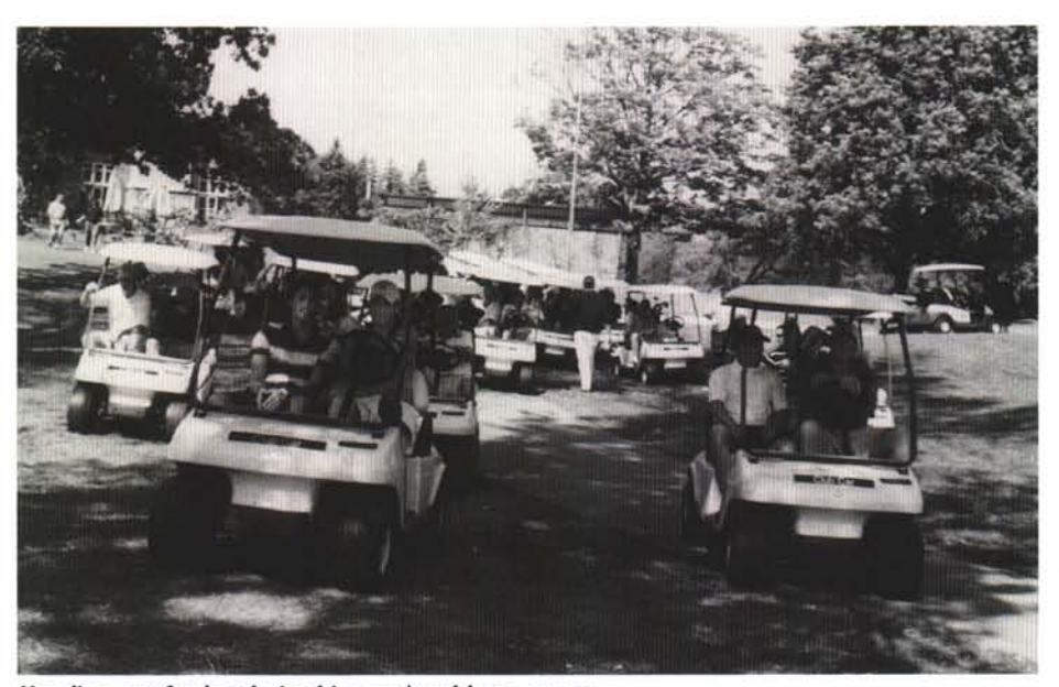
Heading out for battle in this year's sold out event.

The current objective of the WTA Golf Fundraiser is to raise funds to establish another WDGF. Three of these Fellowships are currently funded. There is one in the Soil Science Department and two in the Horticulture Department at the UW-Madison. Each WDGF provides finances for graduate students to do turfgrass