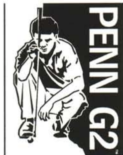
Putting Green Quality Creeping Bentgrass

The list of what makes PENN G-2 so different and so good goes on and on. Moderate fertility, heat tolerance, disease resistance and reduced Poa annua invasion are just a few of the highlights. What it all comes down to is simple. Whether you are building, renovating or interseeding, PENN G-2 is your grass. Why? Because it's as good as it is different.