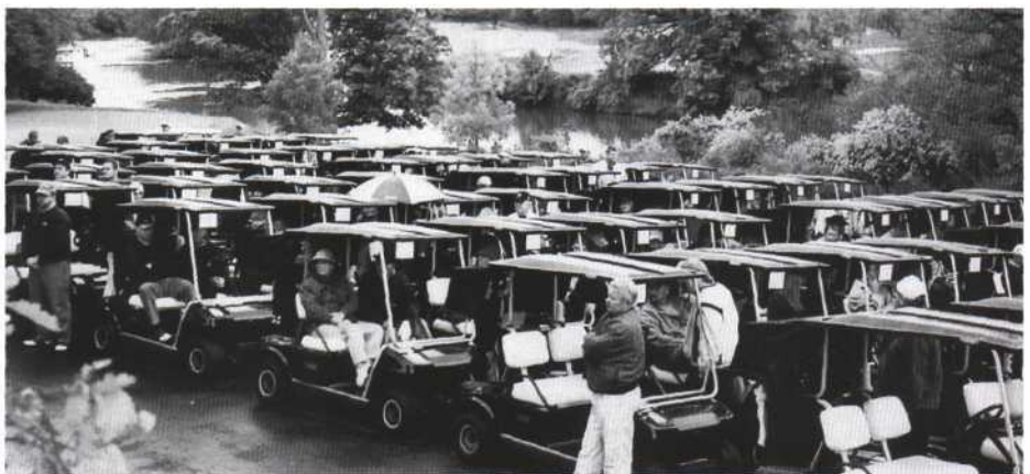
The huge crowd readies to take on the Meadow Valleys.