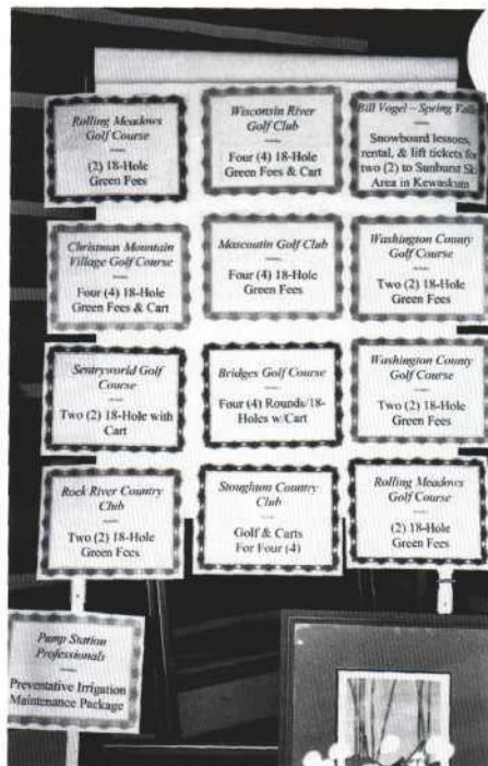
Impressive collection of gift certificates for door prizes.

had a blast. Lots of camaraderie was shared. The weather was close to perfect for October with temps in the low 60s. A few sprinkles came down early in the day, but it wasn't enough to dampen the spirits of anyone. The majority of the round was perfect fall weather. The autumn colors of the trees really showed off the beauty of the natural terrain.