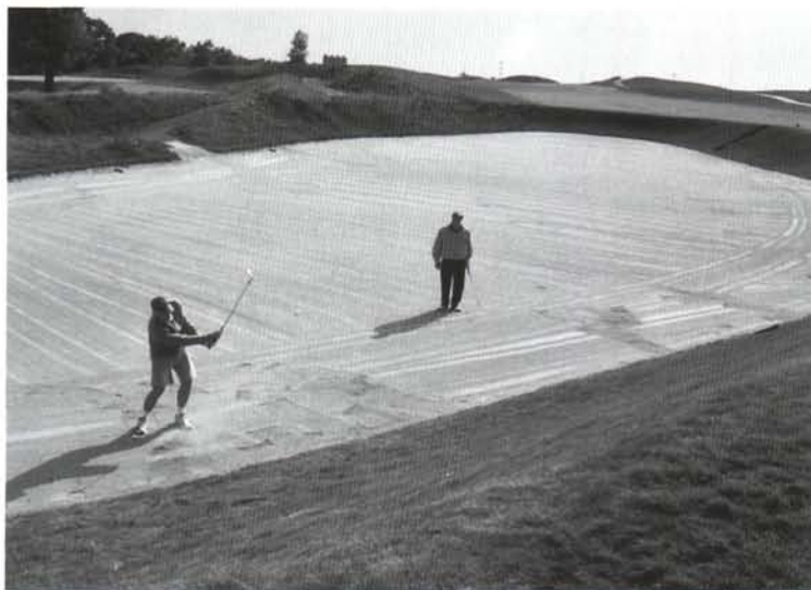
Sahara or bunker?