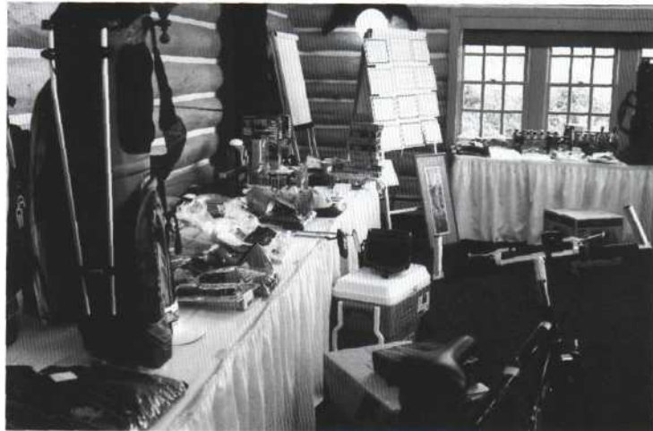
Door prizes abounded.