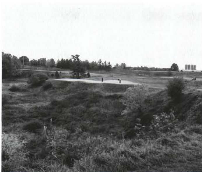
Just a couple of the incredible views.