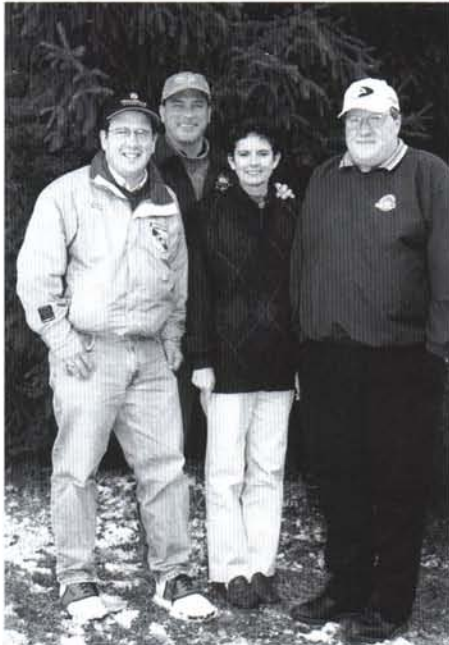
Vendor hosts for the event - Waupaca Sand & Solutions.