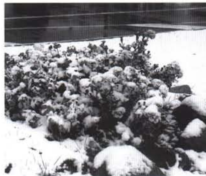
Deja vu?? Two inches of snow welcomed participants to the north woods on Saturday morning.