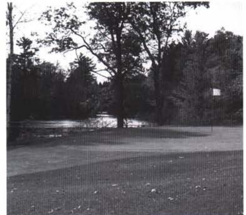
Trout Lake Golf Course-a beautiful venue for the fall event.