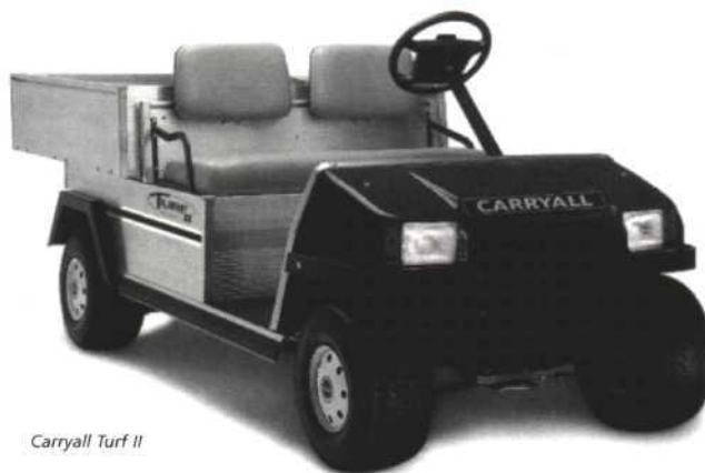
Carryall Turf II

Our new Turf II is loaded with a great package of standard features. All of which makes a great vehicle an even greater value. Turf II is part of Carryall's complete line of versatile, dependable vehicles.