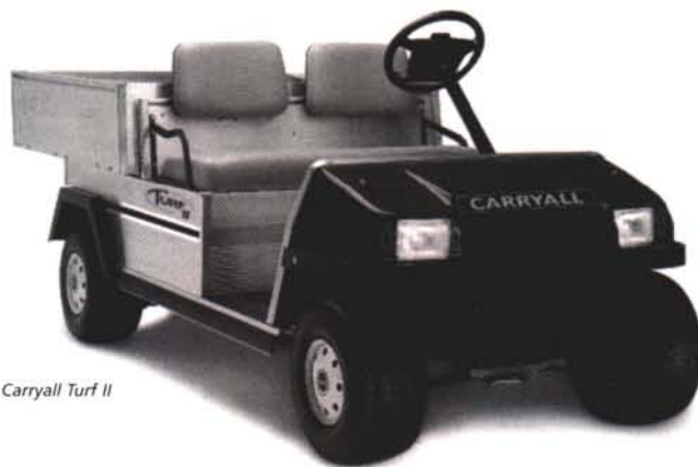
Carryall Turf II

Our new Turf II is loaded with a great package of standard features. All of which makes a great vehicle an even greater value. Turf II is part of Carryall's complete line of versatile, dependable vehicles.