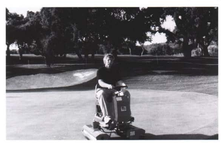
This photo was taken at the 8th green.

On day 3, October 27th, we followed the previously set routine of