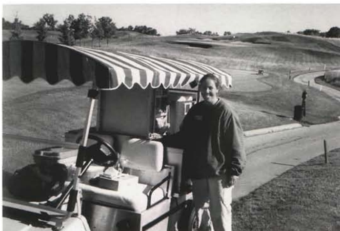
Most important person on the course - the beer cart lady!