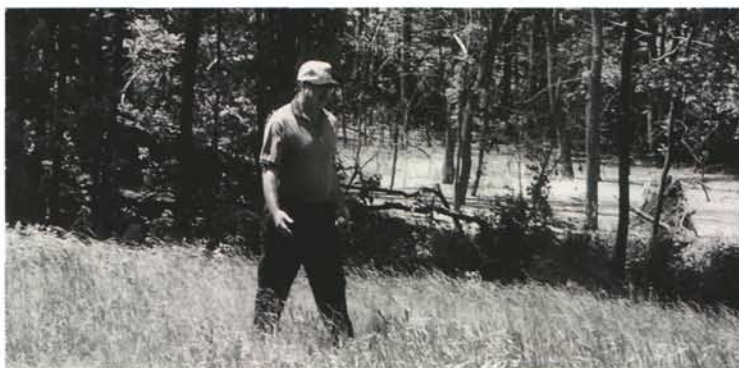
"I know there's a fairway here somewhere."