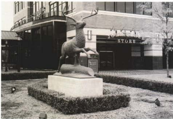
The J.D. Commons has a familiar landmark at its entrance.