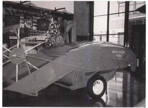
the John Deere 12A combine. My grandfather owned one just like it.