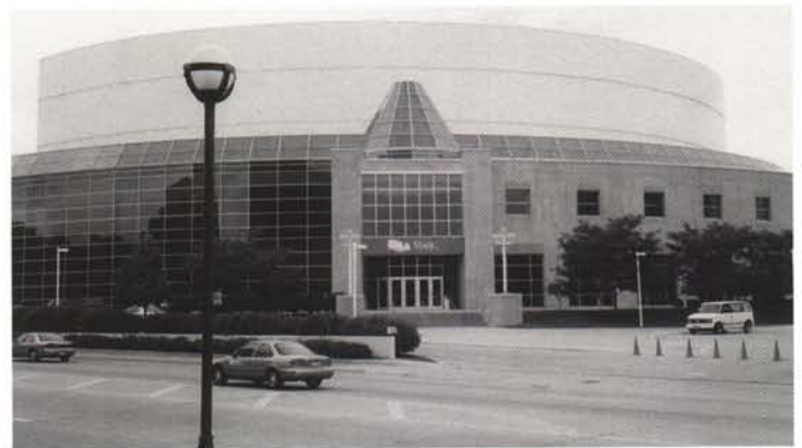
The Mark occupies the site of the first Deere plow factory in Moline.