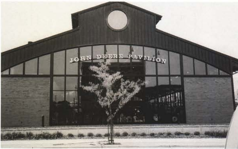
The John Deere Pavilion features some great old machinery like...