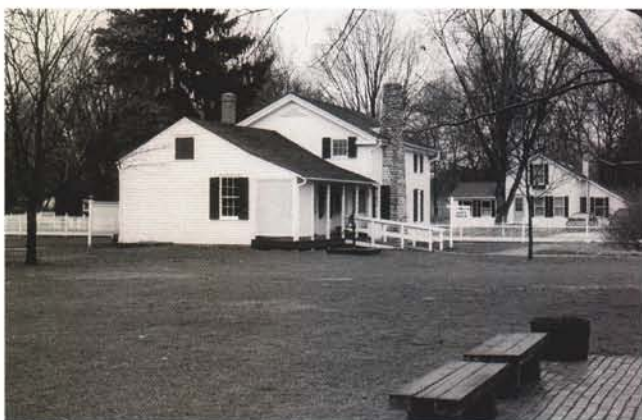
This shows the lawn and the back of the house that serves as the visitor center.