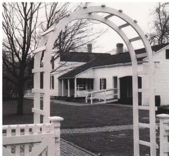
This view of the back of Deere's home shows the well beneath the porch roof that he dug himself.