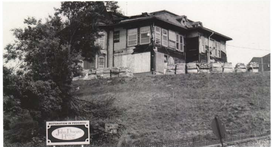
John Deere's home at the corner of 11th Avenue and 12th Street in Moline. It is undergoing an overhaul.

so close to us. Grand Detour is about 50 miles south of the Wisconsin-Illinois border, almost due south of Monroe, Wisconsin. It was a perfect place as Deere's destination. It was a flourishing community that did not have a blacksmith and desperately needed one. When Deere arrived in the village, the sawmill was out of