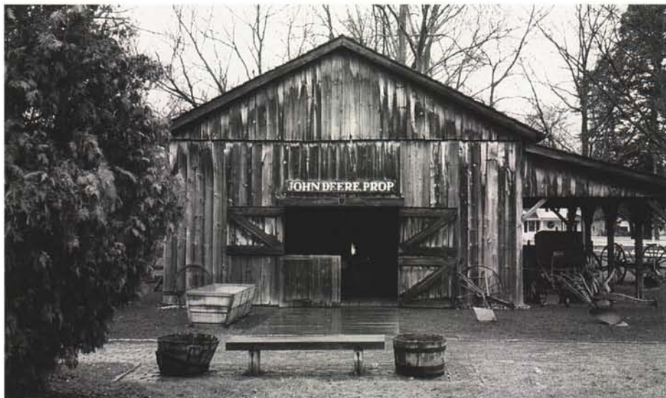
This building is an exact replica of John Deere's first blacksmith shop in Grand Detour.