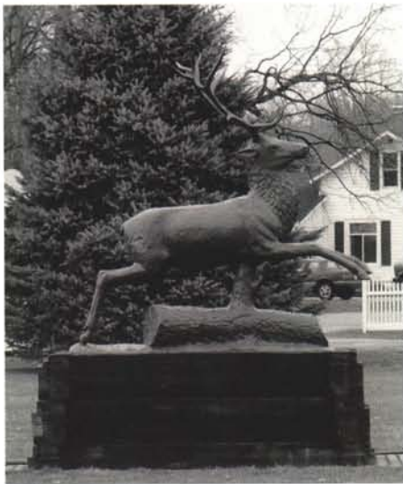
A bronze deer graces the small park at the John Deere historical site.

Two fires in that village forced him to move to Royalton, Vermont to work for another shop. After he accumulated some capital, he went into business for himself, this time in Hancock, his wife's home village.