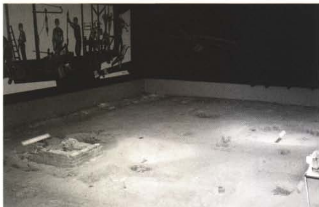
The actual site discovered during an archeological dig, is now under roof and part of the site tour.