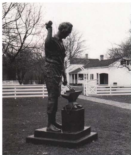
A bronze sculpture of John Deere at work on an anvil.