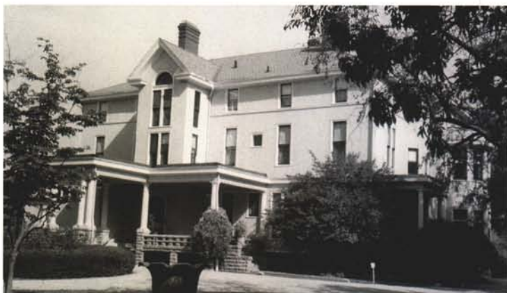
The Charles Deere estate is beautiful. The home is the centerpiece.