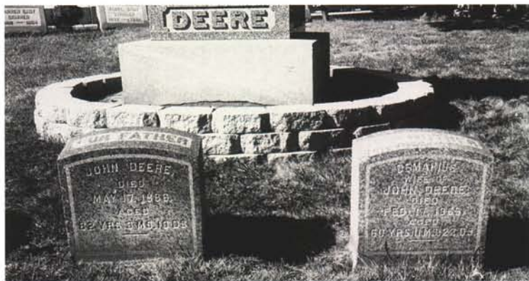
John Deere's gravesite. His first wife is on the right. Her sister, his second wife rests to the left.

chisel, with the help of a striker and sledge, then laid them on the fire of the forge and heated what little I could at a time and shaped them as best I could with the hand hammer. After making the upright standard out of bar iron, I was ready for the wood parts. I went out to the timber, dug up a sapling and made the crooks of the roots for handles, shaped the beam out of a stick of timber with an ax and drawing-knife, and finally succeeded in constructing a very rough plow. I set it on a dry-goods box by the side of the shop-door. A few days after, a farmer from across the river drove up. Seeing the plow, he asked: