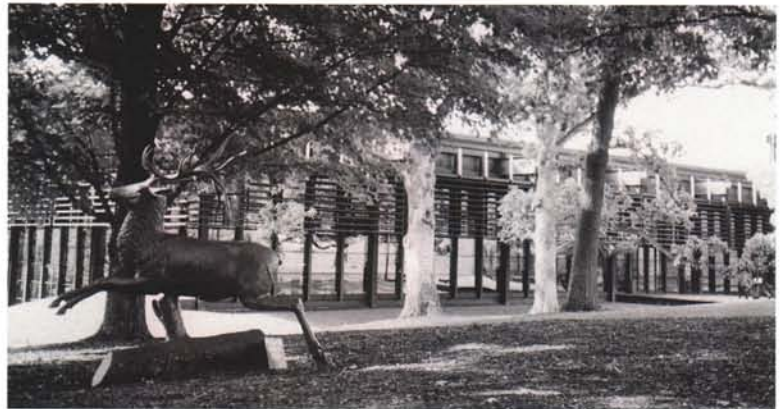
The familiar bronze deer is on the lawn in front of the rusty Deere Administration Building.