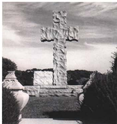
The Deere family plot in Moline.

ed was a plow that was properly shaped so it would turn a clean furrow and one that would polish so soil wouldn't stick.