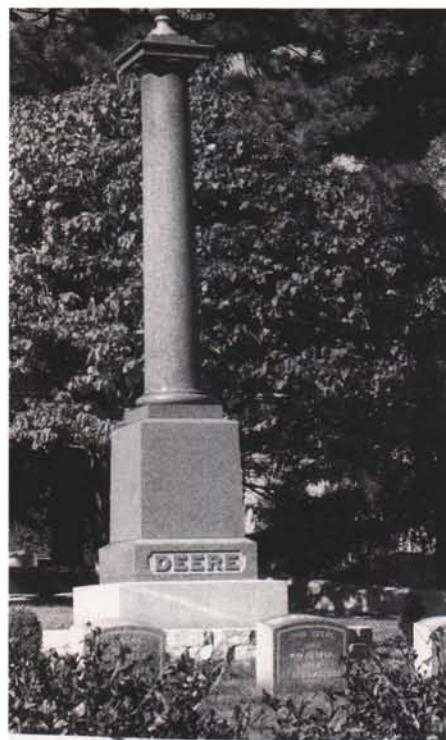
The Deere family plot in Moline.

Deere watched this and saw the farmers' total frustration. He was sure something could be done to solve the problem. All that was need-