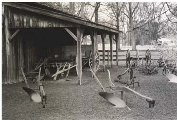
Primitive by today's standards, John Deere built the best equipment of his time.

Over the next nine years, Deere was involved in numerous business relationships. He had a partner in Salisbury, Vermont for a couple of years. From there he and another partner built a blacksmith shop in Leicester Four Corners, Vermont.