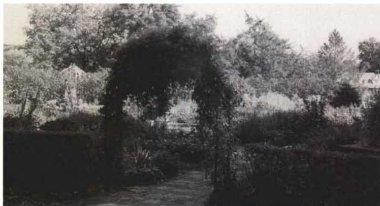
Extensive gardens are part of the Deere estate.

had the pitman repaired and the mill back in operation in a few days.