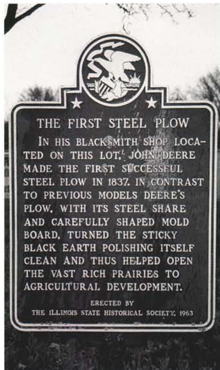
Welcome sign at the John Deere historic site in Grand Detour, Illinois.