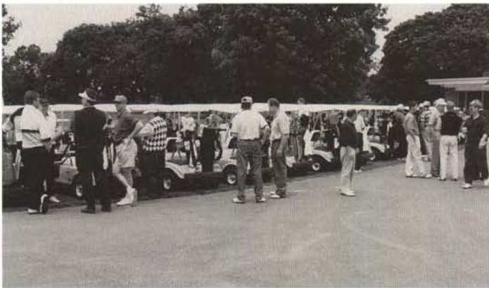
The gang gathered after lunch for a simultee event.