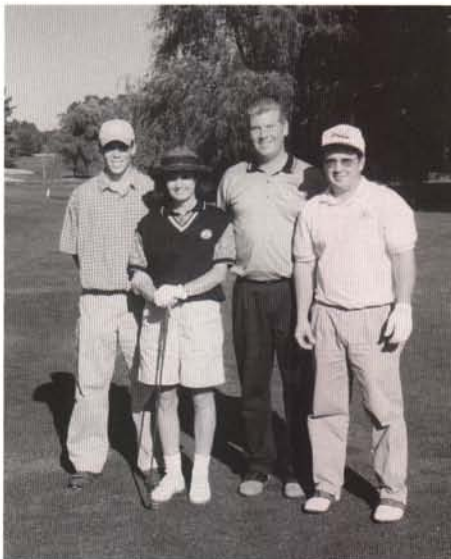
Support from industry was evident through participation from companies like Greensmix,