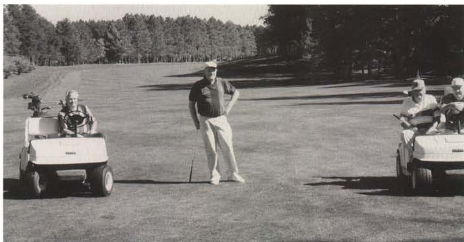
Wisconsin Turf Equipment,

RHONE-POULENC AG COMPANY P.O. Box 12014, 2 TW. Alexander Drive Research Triangle Park, NC 27709 1-800-334-9745