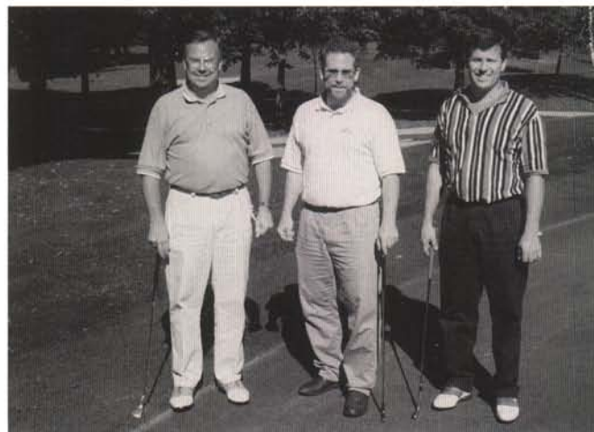
Scotts and many others.