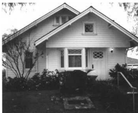
Richard M. Nixon's childhood home, located only a few steps from his museum and library, was close to the Anaheim Convention Center.

ASGCA Conference: The architects usually have a cool meeting, and it