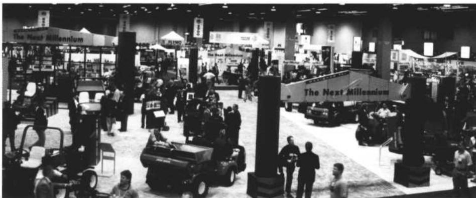
John Deere's presence grows each year.

• The U.S. Marine Corps Honor Guard presented the Colors while the Alley Cats sang the national anthem accapella. It was beautiful and inspiring.