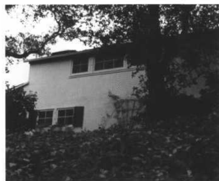
Dr. Alister MacKenzie's "cabin" is located on another famous course he designed, Pasatiempo. Ken Venturi still holds the record low score, 63.