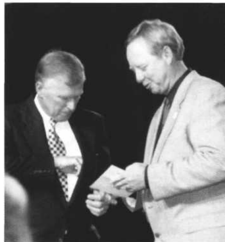
Dan Quayle willingly signed books and gave autographs.