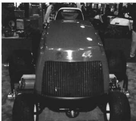
One of 162 Black Knight Limited Edition mowers by Jacobsen, named to honor Gary Player's 162 tour victories.

Opening Session: "Fantastic!" "Awesome!" "Best ever!" These and other comments like them were what I heard right after the opening session. Me? I loved it! Here's why;