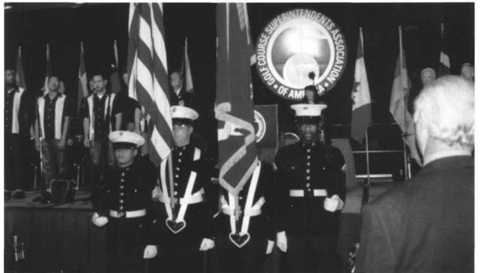
A USMC Honor guard stood at attention while the Alley Cats sang the national anthem.

It didn't rain constantly, contrary to impressions created by news reports, and in-between storms some guys traveled north to check out some of the many great golf courses up there. Although the ATT Pro-Am was canceled at Pebble Beach, the courses were open for a relaxed "look-see", unfettered by any players. There was a group of Wisconsin GCSA members who played Riviera CC, Bel Air (Continued on page 22)