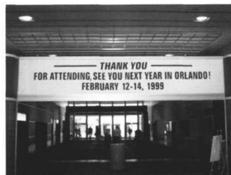
It's back to Orlando next year.

• Don't: Use GCSAA Travel. We even had a difficult time dealing with them for a rental car. The few bucks you save don't cover the cost of the hassle. You have to call (and call