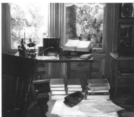
The writing desk in John Muir's library is where many of his books were written.