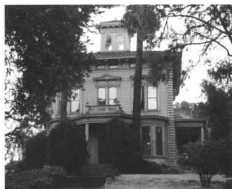
John Muir's home in Martinez, California. He is buried, with other family members, near here.