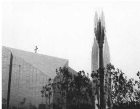
For architecture buffs, the Crystal Cathedral was minutes from the Convention Center.

1-612-702-0701 Bus. • 1-602-702-9205 Fax