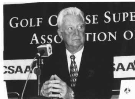
Old Tom Morris award recipient, Ken Venturi, answered questions at a press conference.