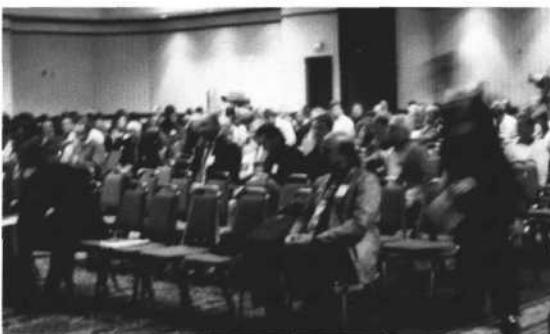
Large attendance at opening session