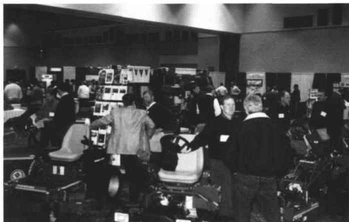
The trade show was packed.

The only thing that could have been improved was the weather. Why does the weather always take a turn for the worse during EXPO week! Record cold temperatures for