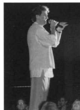
Kenny Loggins provided good entertainment at the annual banquet.