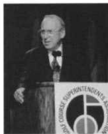
A real-life, all American hero — Jim Lovell, commander of Apollo 13.