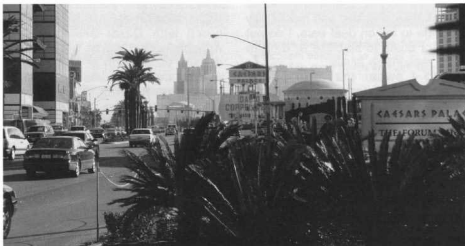
Skyline of the Vegas "Strip" as seen from in front of the Mirage Hotel. New York! New York! is in the distance.