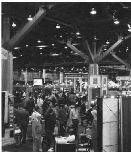
The show floor is a busy place.