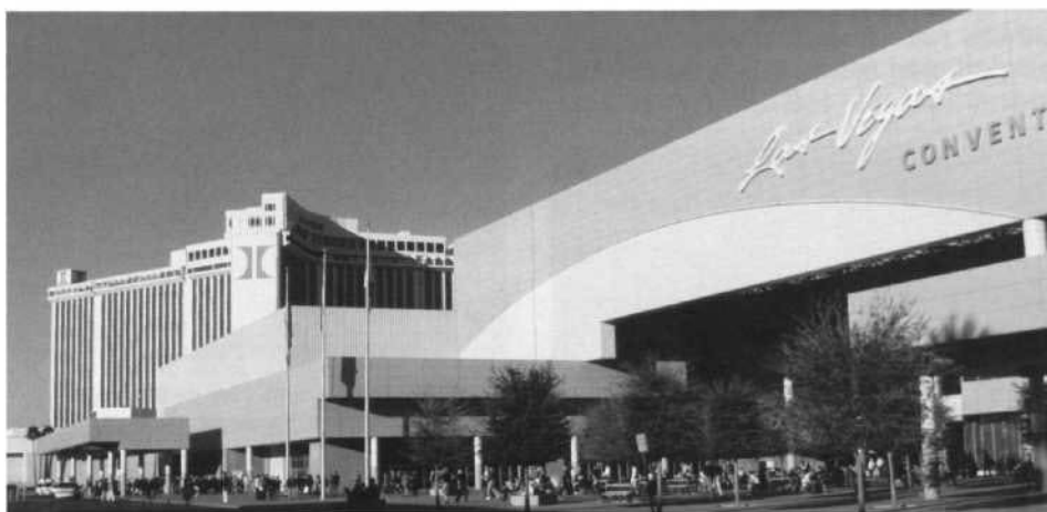
Site of a lot of the conference activity — the Las Vegas Convention Center. The Hilton housed many member during their stay.