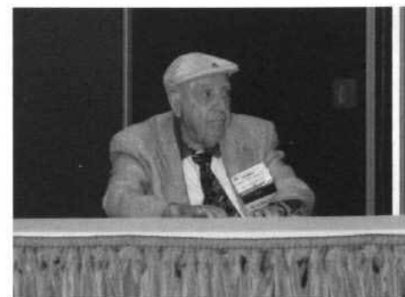
Robert Trent Jones Sr. was a distinguished presence throughout conference. We were honored.