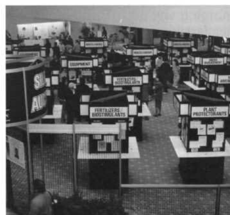
The Silent Auction was a page right out of the Wisconsin Turfgrass Association Field Day.