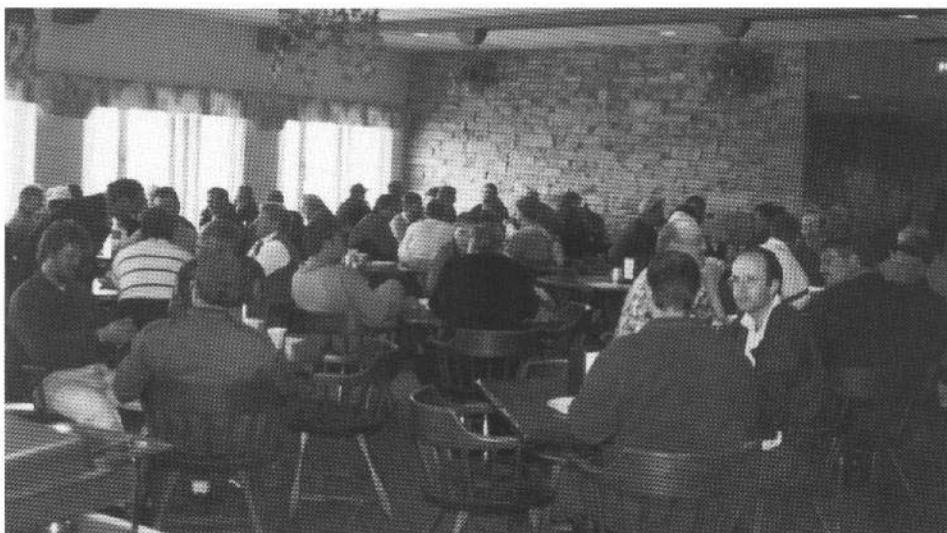
A good sized crowd of "soil blenders."