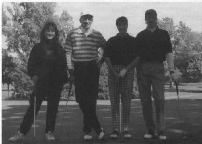
Our great hosts.

The calendar is already marked: October 4&5, 1997; Drugan's Castle Mound golf course, LaCrosse, Wisconsin. Be there or be square! 🏌️