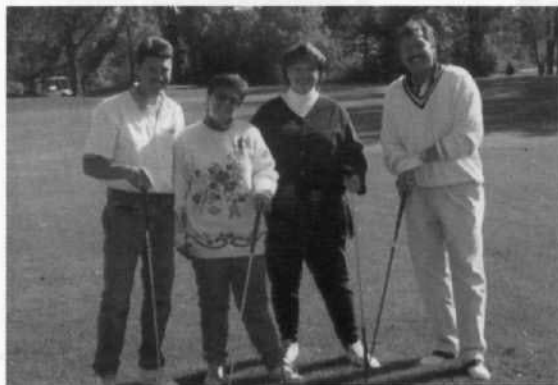
Even the reps get a weekend off!