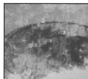
Ottershield Lake Dye