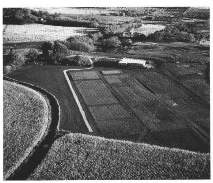
an aerial view of the NOER Facility and its area of expansion.