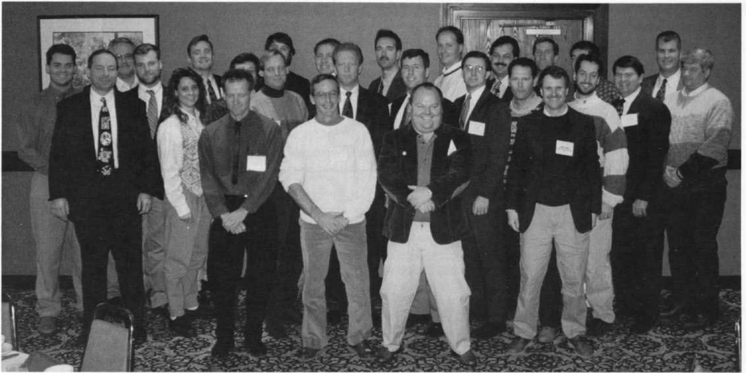
The UW-Madison grads had an alumni breakfast on Wednesday morning.