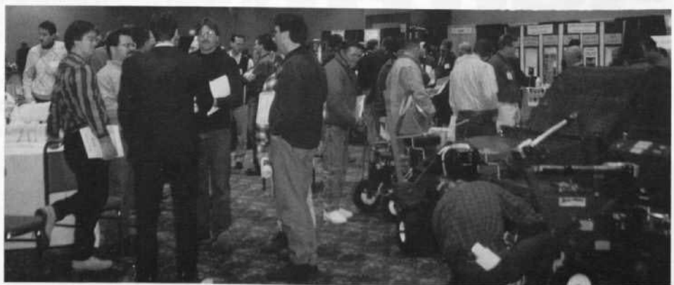
There was plenty of equipment to look at in the Trade Show.