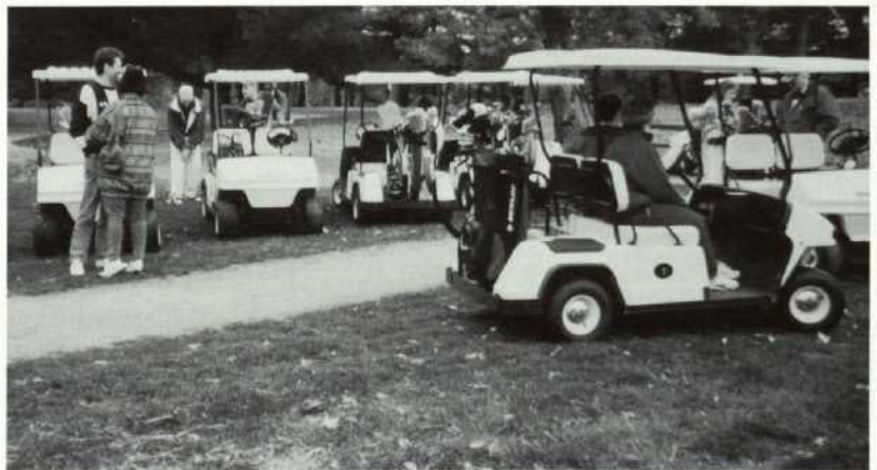
Circle the wagons...