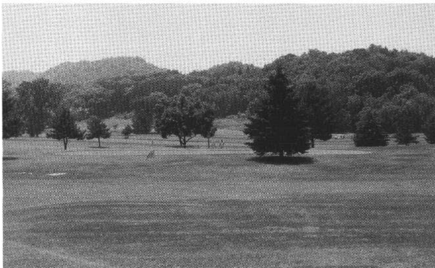
The brutal heat took its toll on the rough areas of Castle Mounds, but did not detract from the beauty of the Wisconsin golf course.

Even though the temperatures were nearing 100 degrees, everyone in attendance had a great time thanks to the hard work and hospitality of the Drugans and the very friendly Castle Mound staff. 🍷